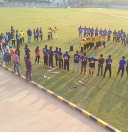
Cricket Ground Avalahalli