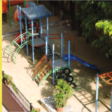
Tiny Tots Play Area